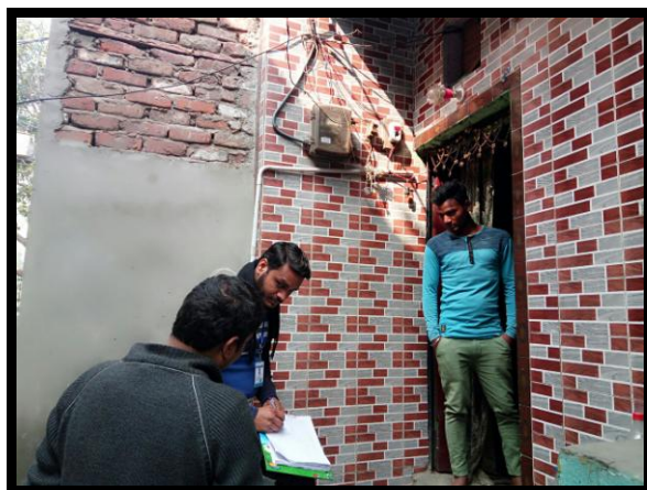
Glimpses of Active Case Finding (ACF) in Mewat and Delhi